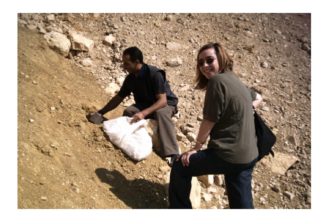
Figure (20): Clay Collection from Ayn at-Tinnah site near Petra.