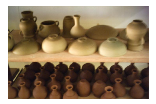
Figure (28): Another Slow Drying Stage.