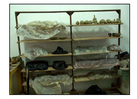
Figure (24): Slow drying after modeling on the wheel.