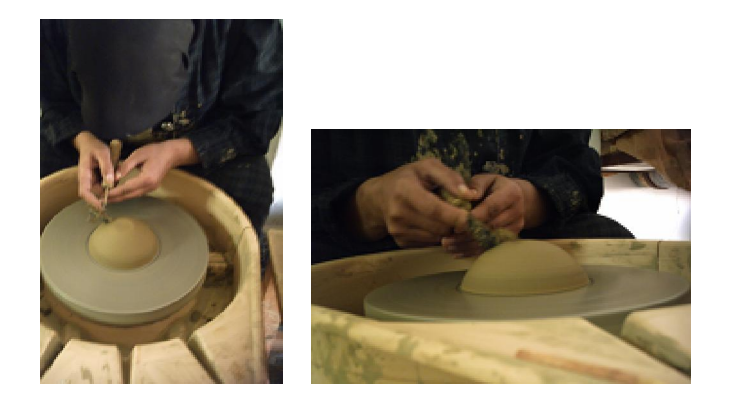
Figure (25): Turning and Trimming on the wheel.