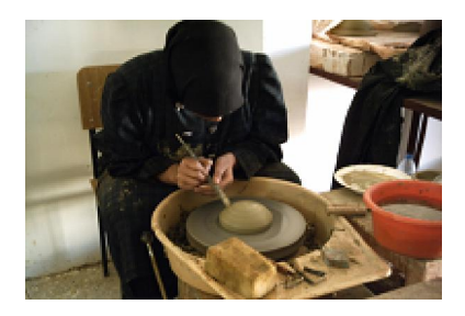
Figure (26): Slipping Stage (if needed).