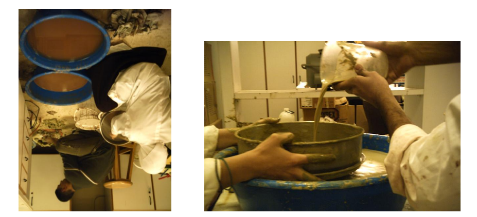
Figure (21): Clay Cleaning and Levigation.

Figure (20): Clay Collection from Ayn at-Tinnah site near Petra.