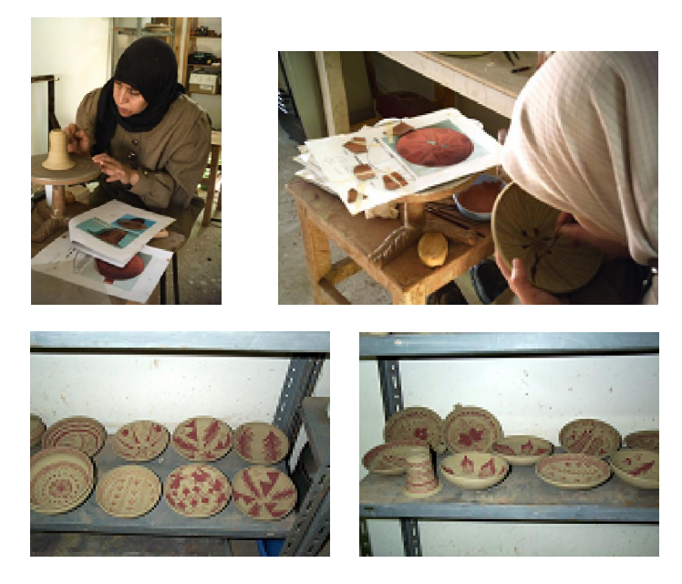
Figure (29): Painting and Decoration.