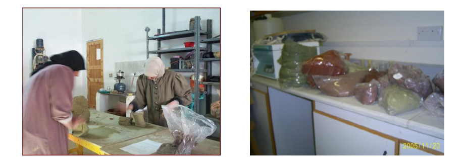
Figure (22): Slurry Partial Drying, Wedging and Kneading.