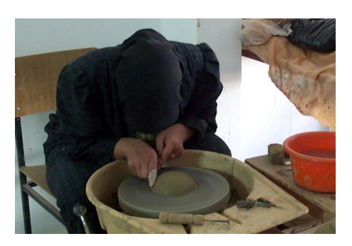
Figure (27): Smoothing Stage.