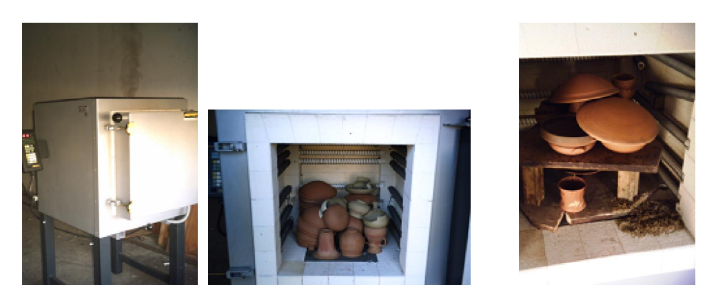
Figure (30): Firing Process and Controlled Firing Programs.